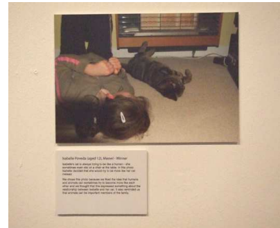
One of our display boards and its caption

If you are showing photographs or other artwork you can get captions printed and mounted on smaller pieces of foamboard which is cut to size. Ask the printer to do this – it's impossible to cut neatly at home!