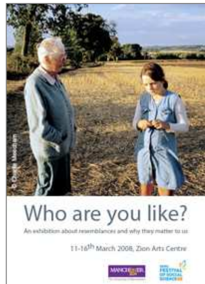
Postcard advertising our exhibition

When you are designing your leaflets, pick up a few examples from other exhibitions and see what information they have on them. This should make sure you have all the basics (title, venue, opening times, details of a launch event if there is one, brief summary, logos) and it might give you other ideas too. Include a small map if you can.