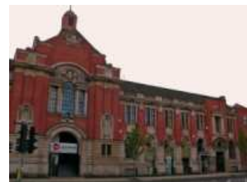
The arts centre we used for our exhibition

We chose a community arts centre for our exhibition. It was a nice place to visit and it had a lively atmosphere. It was in a good location and was within budget. Staff at the gallery were friendly and helpful, too.