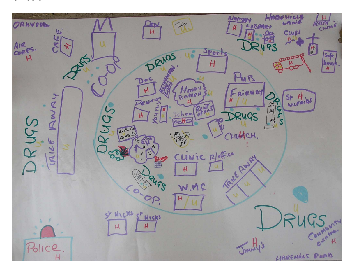
Figure 3. A participatory map of what makes five women aged 25-32 and all resident of the area healthy and unhealthy about living in a place.

Participatory maps can be done with individuals and with groups. There are particular issues to consider with groups. Group maps are best achieved with a homogeneous group. The interviewer must facilitate negotiation among the group members about how the map is drawn. One effective way of achieving this negotiation is to ask the group to nominate a person to draw the map at the outset (see Figure 3). Generally, this is the person considered by the group to be the most artistic . But make sure pens are available for all group members to use, or to hand to the map writer so ownership and interaction is encouraged throughout the mapping for all group members.