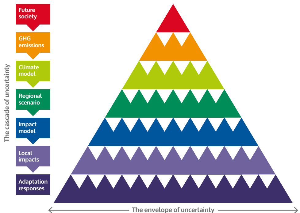
Figure 1: Uncertainty is inevitable – climate, social, economic and environmental uncertainties all shape adaptation responses. Wilby and Dessai, as cited in Pringle 2013: 4