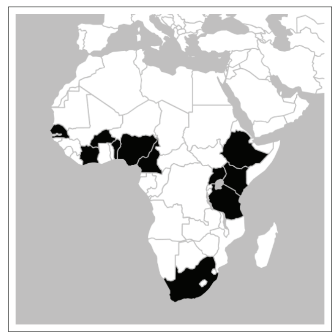
FIGURE 2: Overall evidence of greatest capacity by region.

Looking across all of our data, the following discussion summarises where we found evidence of the greatest impact evaluation capacity per region, as visually represented in the map in Figure 2.